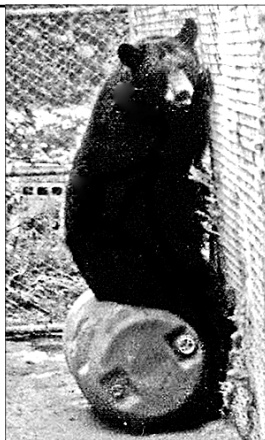
Smarter than the average bear

two and they instinctively knew she was in a better place. My heart is sad without my Ummie Yummie Bear. The years fly by like moments and it's so hard to come to terms with one's passing, be it animal or human. We all need to cherish each and every moment and love all that is around us each and every day. For everything